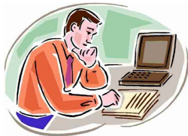
Relocation Management Company

The provision of relocation services can involve personnel from different companies, each with their own system.